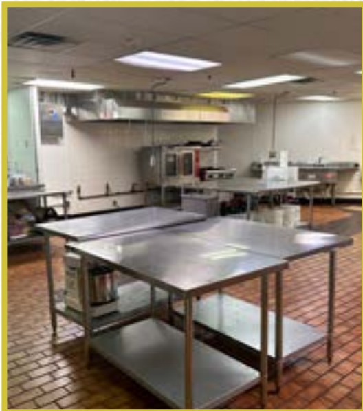
AMPLE WORK SPACE